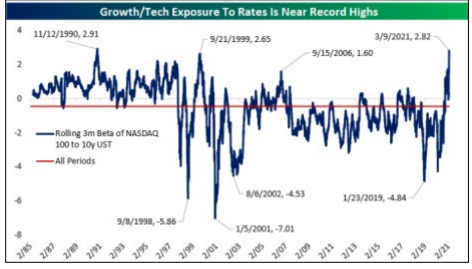
Even though the underlying force behind bond market moves is an improving economic outlook, higher rates are raising fears that the equity rally could fizzle. The recent volatility has been concentrated in growth/technology stocks that are seen as vulnerable to higher discount rates. In fact, the beta of the Nasdaq 100 to treasuries has neared record levels. (Chart 2)

Bond yields have jumped sharply in recent weeks. But this isn't so surprising ... in our last market commentary, we felt 2020 marked a secular low point for rates and urged clients to re-think how bonds fit in their asset allocation. The clear catalyst for this move has been widespread optimism around reopening the economy, which could potentially lead to higher inflation and earlier Fed tightening. With the vaccination rollout in full gear and plenty of fiscal support in the pipeline, investors have swung from worrying the economy will grow too slowly to worrying the economy will grow too fast.